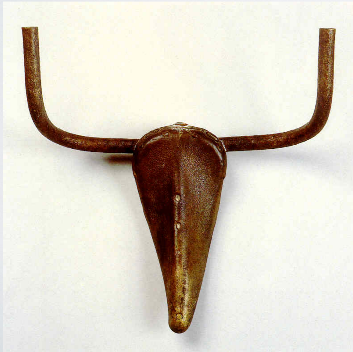
Picasso: Bull's Head, 1947 (bicycle saddle and handle bar)